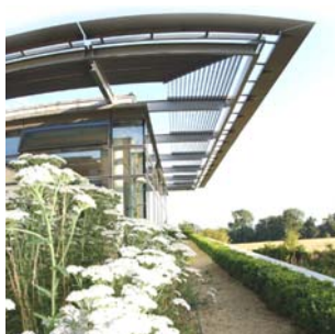
Wessex Water's operations centre, hailed as one of the greenest offices in Europe

In our Sentul project, we made the decision to maintain a 35-acre green lung in the heart of Kuala Lumpur as a park for the use of our residents because we believe that this will enhance the quality of life of the people who buy our properties. We have adopted this philosophy throughout all our current residential property developments, such as Lake Edge in Puchong, Lake Fields in Sungei Besi and Pantai Hillpark. We have placed the focus on reducing the number of units in favour of maintaining a balance between nature and development, and have adopted building and design techniques that make the most of natural sunlight and improve airflow to reduce the need for artificial light and air-conditioners.