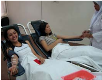
YTL employees at the National Blood Bank donation drive

The YTL Group recognises our duty to be a good neighbour. We are an active partner of cities and communities, working closely with schools and charitable organisations to educate, support and engage with projects across Malaysia. From tackling poverty to helping children lead healthy, energetic lifestyles, we endeavour to build a better future for everybody.