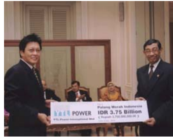
Donation to the Indonesian tsunami fund