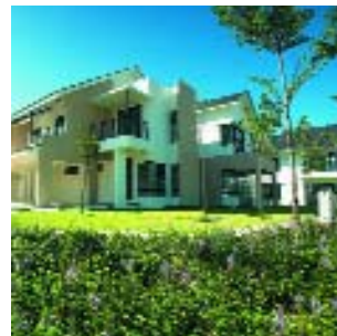
Lake Edge in Puchong