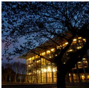
The majestic Kuala Lumpur Performing Arts Centre in Sentul Park