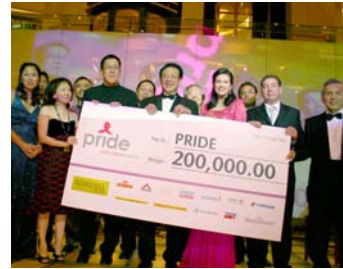
Pink Ribbon Deeds (PRIDE)