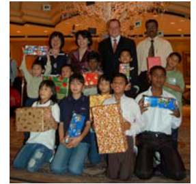
Toys for Tots at the JW Marriott

The geographical diversity of our operations requires a heightened awareness of the social and economic conditions in the countries in which the Group operates. Our presence in Indonesia brought the Aceh tsunami that devastated swathes of the Asian region in December 2004 much closer to home and the Group contributed RM2.0 million to the Malaysian Government's RM12.95 million fund to assist with the relief efforts of the Indonesian Government. The Group also contributed Rp3.75 billion to the Indonesian Red Cross to assist with its various humanitarian programmes for Indonesian migrant workers returning home under the amnesty granted by the Malaysian Government.